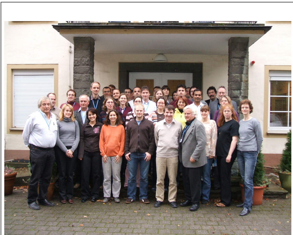
Gruppenfoto 3. Herbstkolloquium, 24./25. November 2006 Participants of the 3 rd Autumn Symposium, November 24/25, 2006

Teilnehmer von links nach rechts ( Participants from left to right )